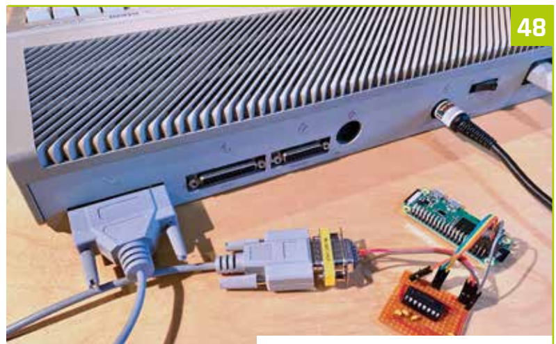
Add internet to a vintage computer