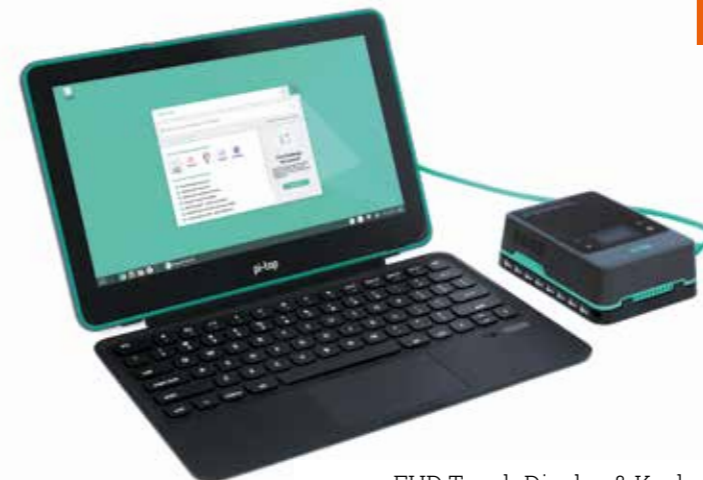
FHD Touch Display & Keyboard