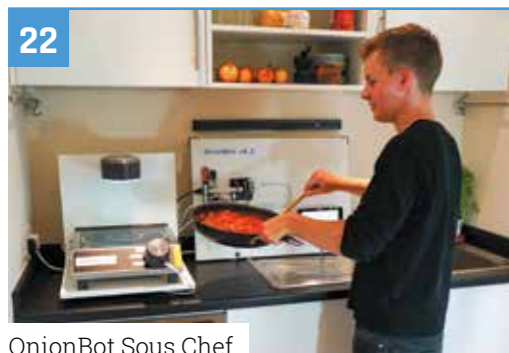
OnionBot Sous Chef