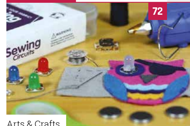
Arts & Crafts