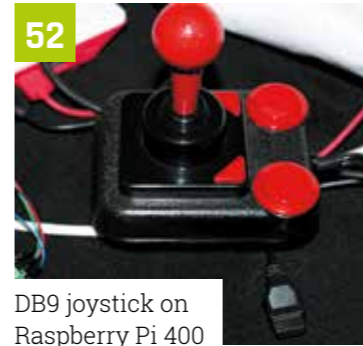
DB9 joystick on Raspberry Pi 400