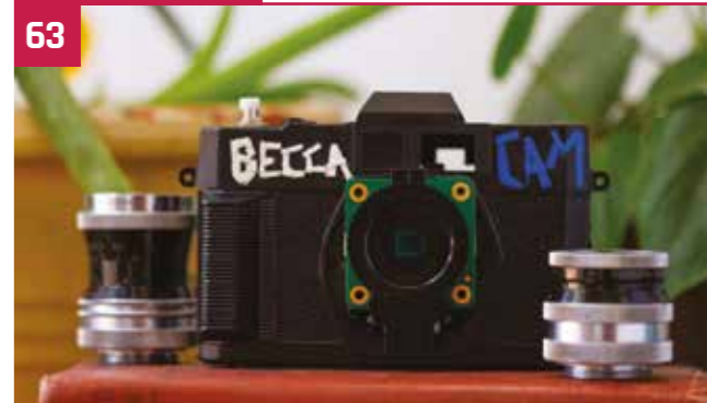
Build Christmas Gifts