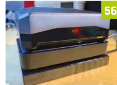
Ultimate home server - part 5