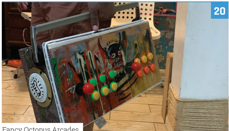
Fancy Octopus Arcades

DISCLAIMER: Some of the tools and techniques shown in The MagPi magazine are dangerous unless used with skill, experience, and appropriate personal protection equipment. While we attempt to guide the reader, ultimately you are responsible for your own safety and understanding the limits of yourself and your equipment. Children should be supervised. Raspberry Pi Ltd does not accept responsibility for any injuries, damage to equipment, or costs incurred from projects, tutorials or suggestions in The MagPi magazine. Laws and regulations covering many of the topics in The MagPi magazine are different between countries, and are always subject to change. You are responsible for understanding the requirements in your jurisdiction and ensuring that you comply with them. Some manufacturers place limits on the use of their hardware which some projects or suggestions in The MagPi magazine may go beyond. It is your responsibility to understand the manufacturer's limits.