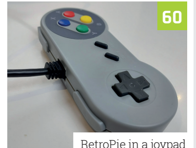
RetroPie in a joypad