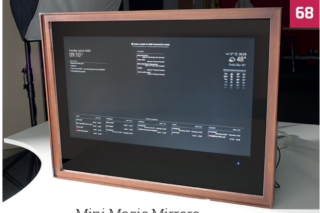
Mini Magic Mirrors