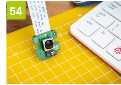
Control Camera Module settings