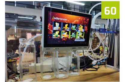
Make an automated bartender