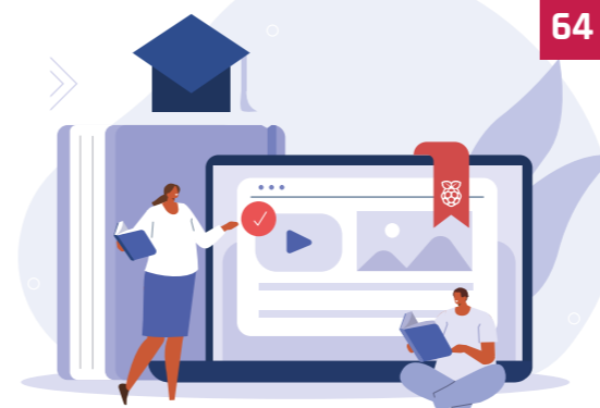
Work and Learn with Raspberry Pi